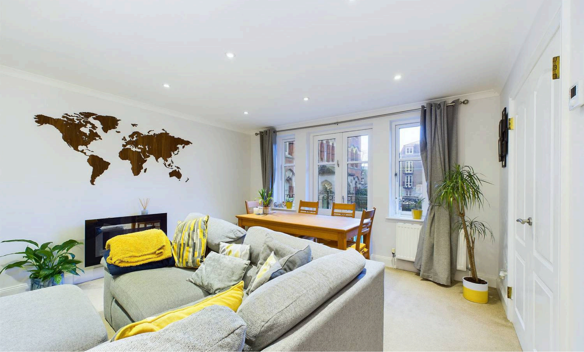
3 Union House St. Georges Place, Cheltenham £315,000